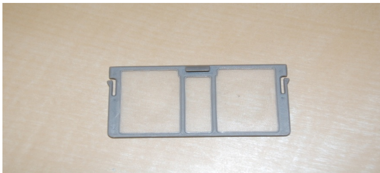
This is what the filter looks like after cleaning.