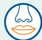
New loss of sense of taste or smell