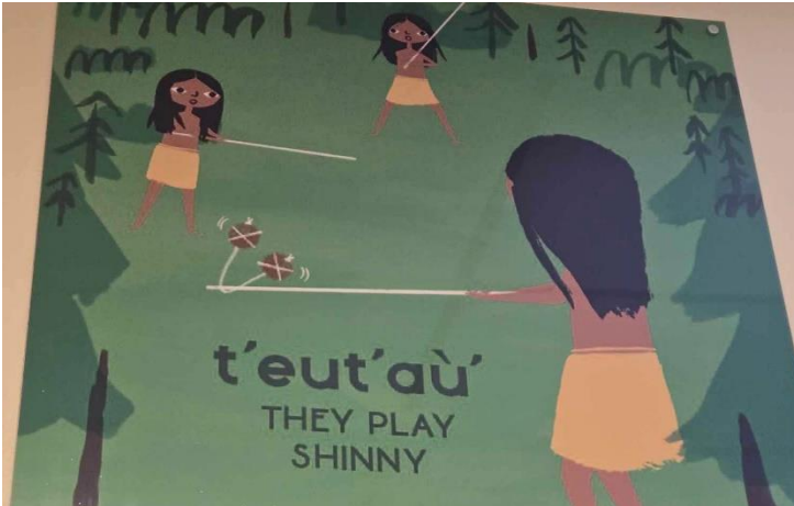
Figure 1 Cow Creek Health and Wellness Center

Native Games are a celebration of our cultures. We will be having a wonderful day of archery, shinny, hand games, atlatl, first foods, and more! “These ancient skills are important to all people: Just like storytelling, values of the culture are infused into the games. The games teach honor, respect, and responsibility to others - key values that have been lost, as modern society promotes to be “the individual best”. The games address American Indian health from a holistic stance as education is paired with spiritual, mental, and physical survival skills of past.”